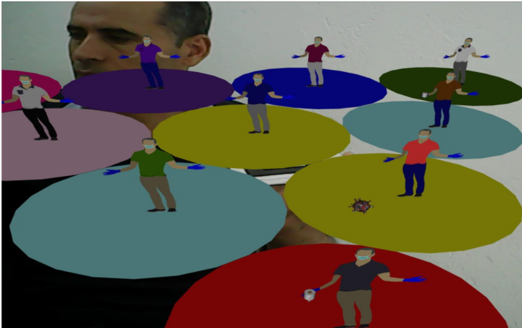
Figure 4: Application of VR/AR, for learning and treatment of ASD Communicative skills (Teaching respect for distancing during the corona virus pandemic)