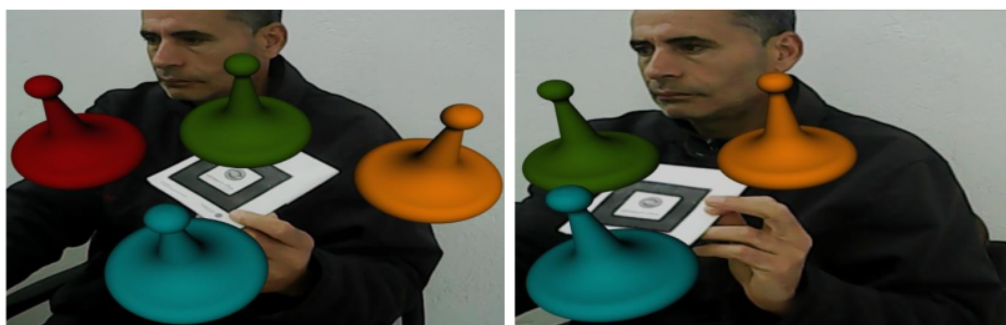
Figure 3: Concentration test

According to an analysis of the data, it also appeared that most professionals were interested in the application of VR/AR on children and young with ASD.