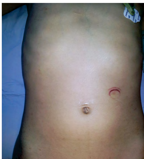
FIGURE 2. Traumatic mark (bicycle handlebars) - jejunal perforation

Unlike penetrating injuries, when surgical exploration is obvious, in the case of young children with abdominal contusion, the injuries of hollow organs can be overlooked at the initial assessment, because of a poor communication between doctors and patients, difficult interpretation of symptoms when there are associated other injuries, but also because of the initial lack of ultrasound signs of perforation. Commonly seen in adults, but also in juvenile patients who are part of certain socially disadvantaged categories, acute poisoning with alcohol or other types of drugs may be the cause of the accident and may mask the painful posttraumatic symptoms (14). Delayed diagnosis and adequate treatment lead to an extended duration of hospitalization, elevated costs and rates of morbidity (15).