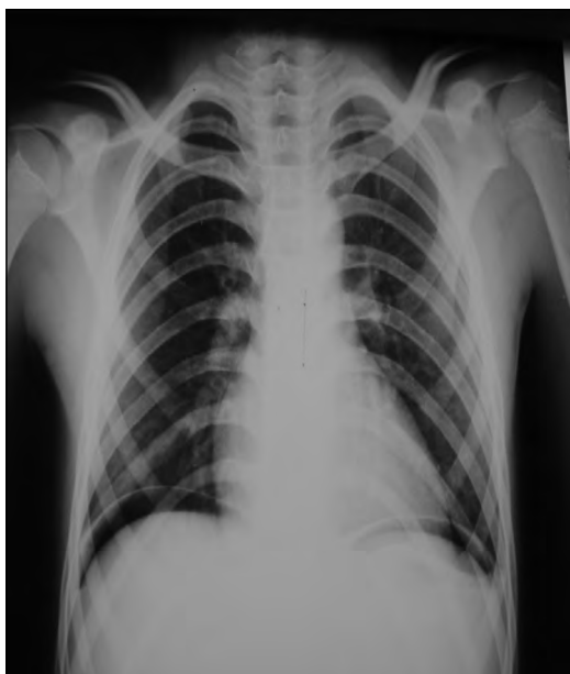
FIGURE 1. Pneumoperitoneum through cavitory organ perforation

With an accuracy of 86%, a sensitivity of 94% and a predictivity of 92%, abdominal computed tomography can detect intestinal and mesenteric injuries or perforations. The mesenteric trauma requires dynamic evaluation due to its unfavorable evolution in the next hours or days (11). However, the need for computed tomography scan may be obviated in a subset of low-risk pediatric blunt abdominal trauma patients presenting with a Glasgow Coma Scale of 14 to 15, a normal abdominal examination result, and a negative FAST result (12). Diagnostic peritoneal puncture and lavage are simple maneuvers that can reveal a hemoperitoneum caused by solid viscus rupture or an intestinal perforation through the detection of intraperitoneal liquid, but they are not specific and more than that, they are invasive and less practicable for children who don't cooperate, being replaced by abdominal computed tomography. Laparoscopic exploration has the advantage that it can accurately diagnose and, at the same time, can clean, wash and suture intestinal perforations with minimal bacterial contamination.