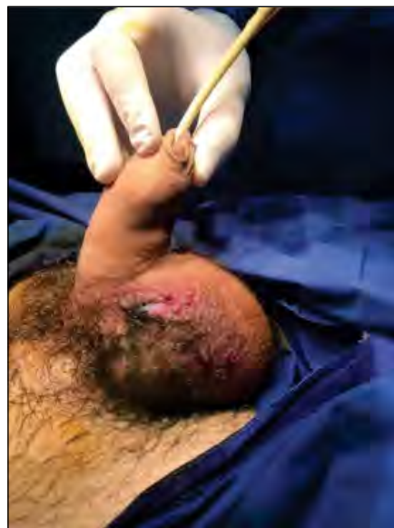
FIGURE 4. Scrotal wound removing the methyl blue inserted into the urine probe (bladder perforation)

Mortality rate for abdominal trauma associated with hollow organ perforations is approximately 10%, being the highest when the injuries are multiple or associated with other lesions (3,20). The highest morbidity and mortality rate occurs in gastric perforations, increasing parallel with the time passed to surgery: intervention within 2 hours leads to 2% mortality, while after 24 hours to over 30%, due to traumatic lesions associated with septic shock (21).